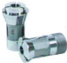
Star & Citizen