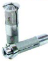
Star & Citizen