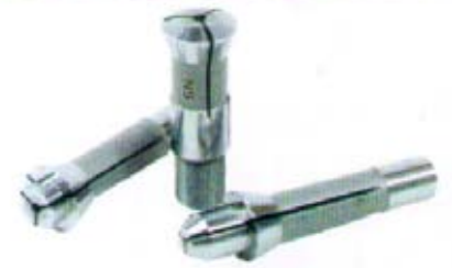
Star & Citizen